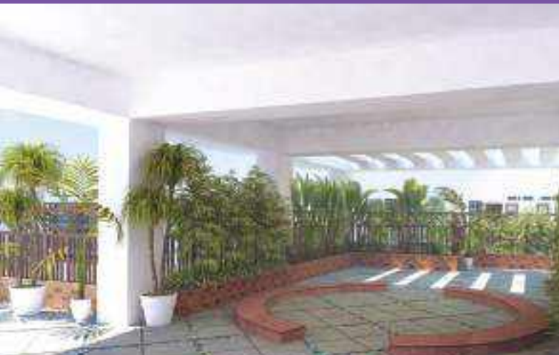
Kids Play Area (Terrace)