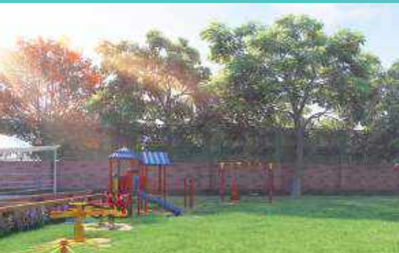
Garden and Play Area