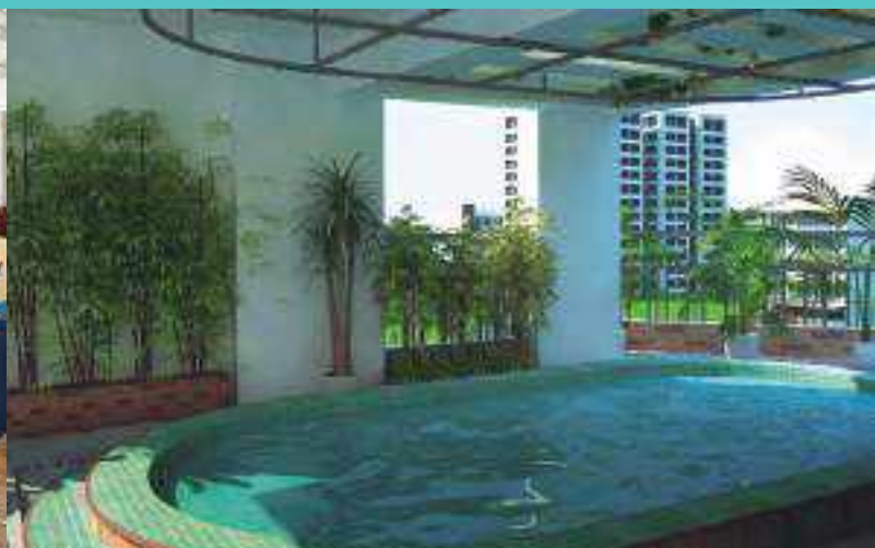
Terrace Shower Area