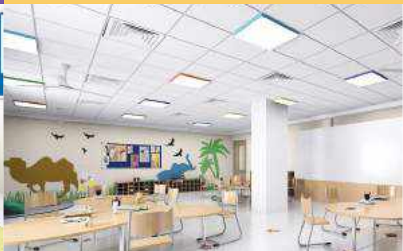
Art and Craft