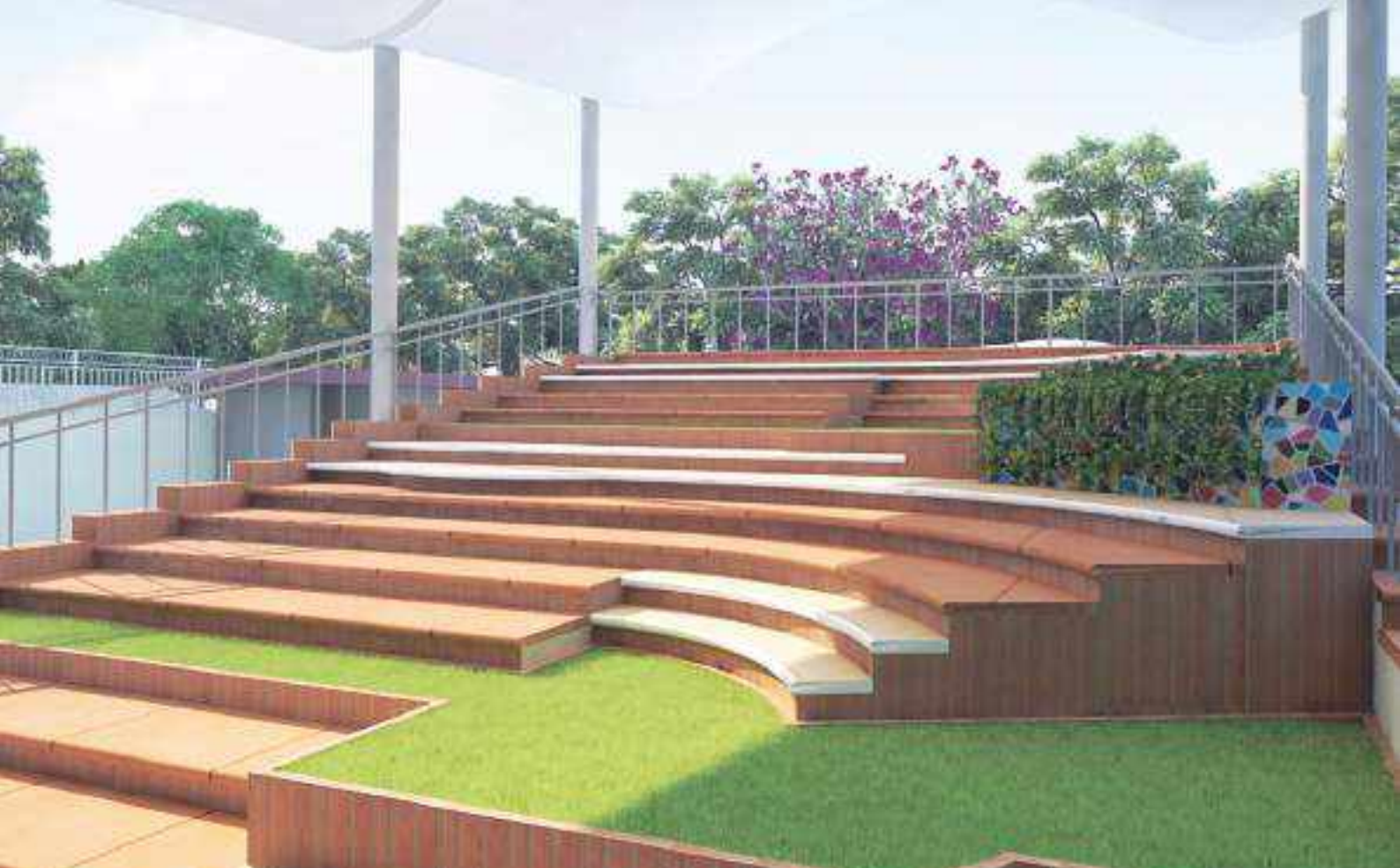
Open Air Theatre